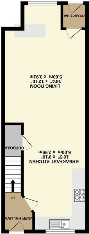
GROUND FLOOR 435 sq.ft. (40.4 sq.m.) approx.