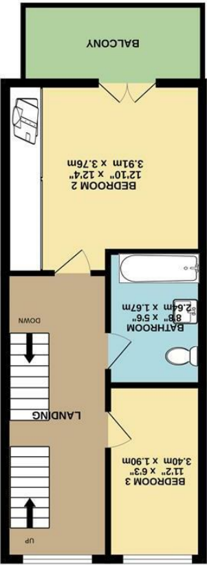
1ST FLOOR 396 sq.ft. (36.8 sq.m.) approx.